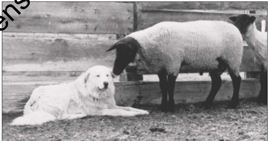
Figure 2c.—Again with squinted eyes and ears back, the dog avoids direct eye contact with sheep.