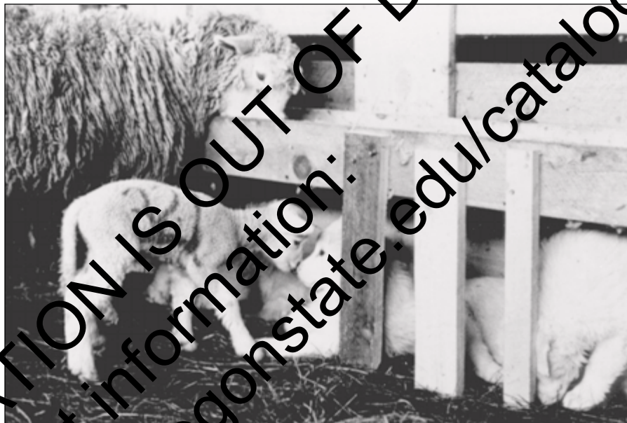
Figure 1—These 8-week Maremma pups are being raised in the lambing barn. The vertical boards nailed to the feed trough give pups a place to escape from a ewe that lay butt. Sniffing nose-to-nose is the start of social bonding. Note the similarity of the interaction between this lamb and pup to the ram and adult dog in Figure 2b.

Training a livestock-guarding dog is primarily a matter of raising the dog with a sheep to establish a social bond between sheep and dog (Figure 1). It is a process that depends on supervision to prevent bad habits from developing and on establishing limits of acceptable