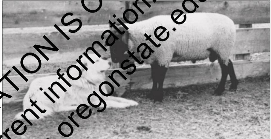
Figure 2b.—Eyes are squinted, and ears are back in this nose-to-nose sniffing.