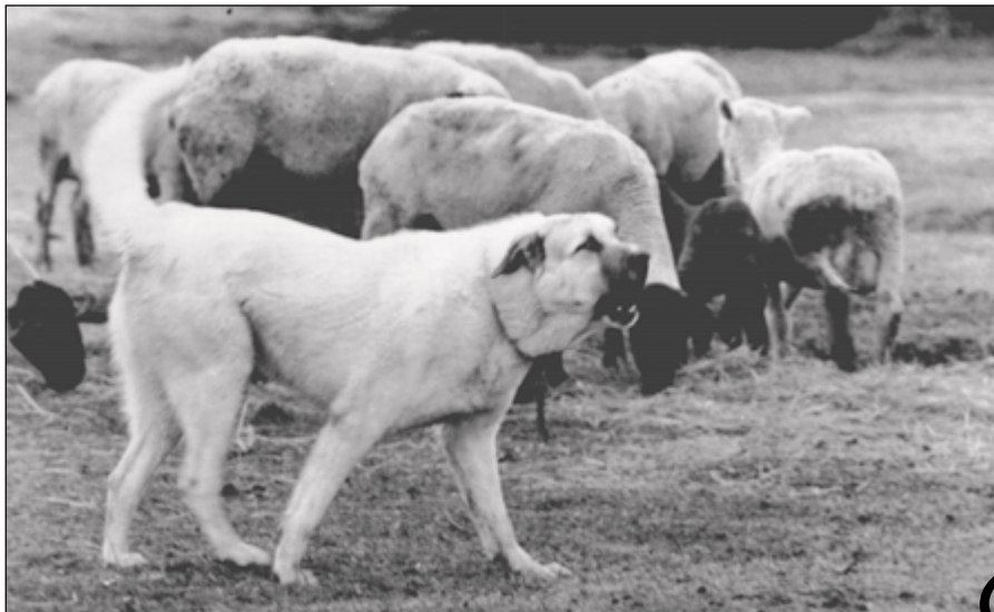
Figure 3.—This is a display of approach-withdrawal behavior. There's real uncertainty here: The dog's hackles and tail are raised in a posture of dominance or aggression, but his ears are back and he avoids eye contact with the intruder—postures of submission. The dog circles between sheep and intruder. Will this display become aggressive? The chance that it might is enough to ward off most predators. Note how calmly the sheep are feeding in the background.