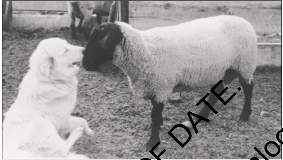
Figure 2a.—These three different submissive poses of an adult Maremma allow sheep to investigate, and each one fosters dog–sheep bonding. Here, eyes are squinted and ears are back; forepaw and rear leg are raised. The dog is prepared to roll over on its back as in Figure 4a.

Approaching sheep with ears back and squinted eyes, avoiding direct eye contact, and lying on the back are called submissive behaviors (Figure 2). Sniffing around the head or anal area is called investigatory behavior . Both are desirable behaviors, signs that your dog has the right instincts and is working properly.