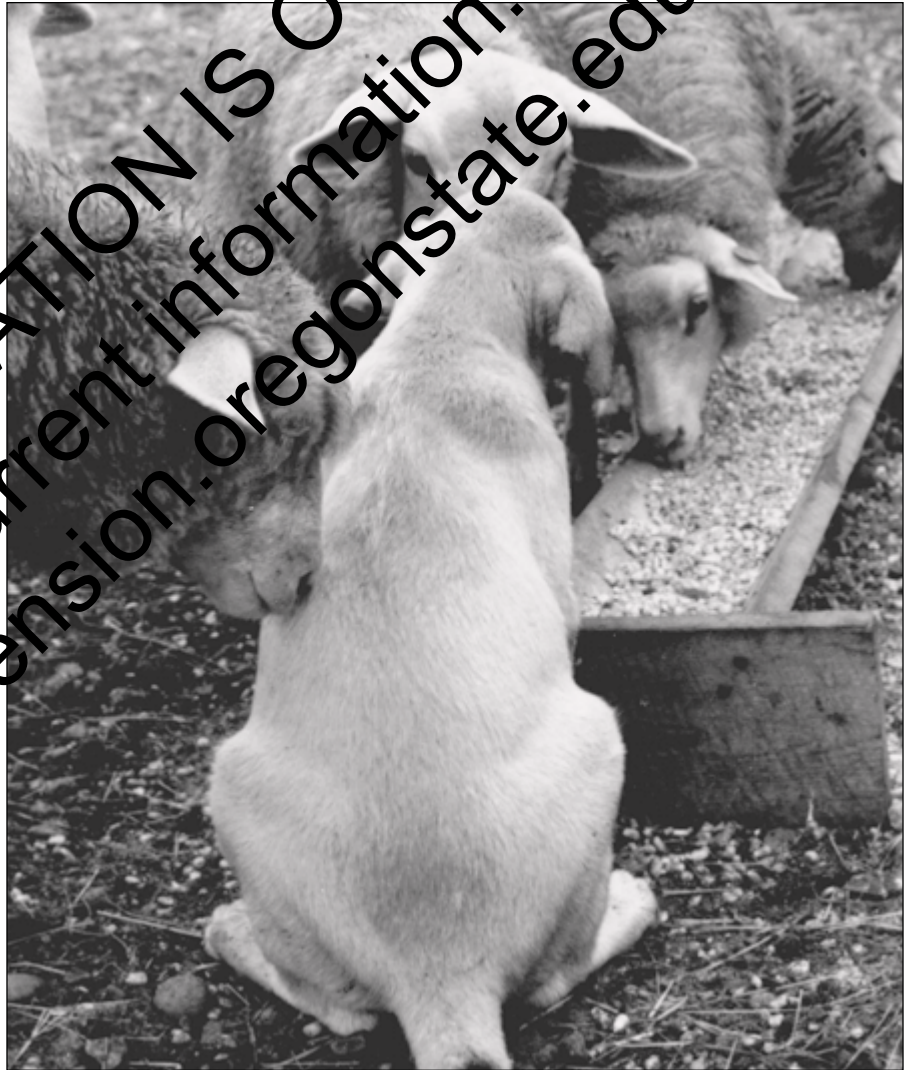
Figure 4b.—The pup's sitting posture is another aspect of submissive behavior, this time with a touch of curiosity—what are those sheep eating?